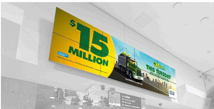
Ultra screen 2x4 (46" screens)