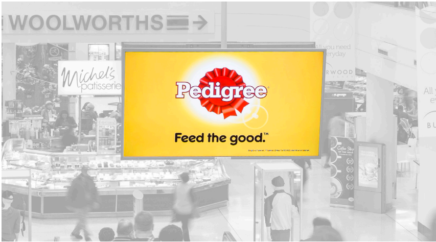
Super screen - 90"