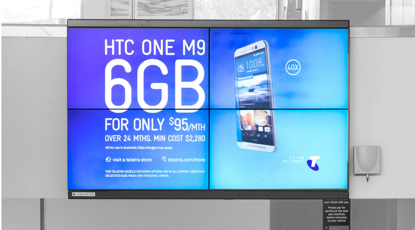
Tiled Super screen 2x2 - 92" screen